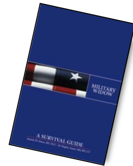
Military Widow: A Survival Guide

Now with a credible resource to fill the void, the Department of Defense gives a copy of Military Widow: A Survival Guide to America's newest military widows.